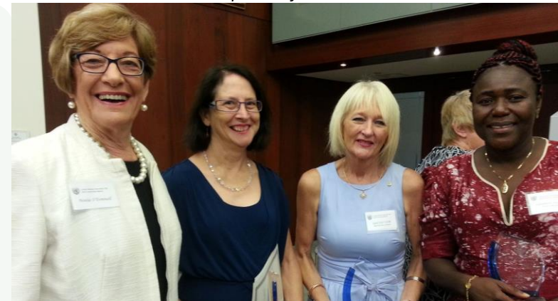
Below: NCWQ member recipients of the UNAA QLD Awards