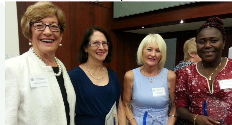
Below: NCWQ member recipients of the UNAA QLD Awards