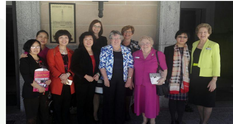
Above: NCWQ members with Women's Federation of Shenzhen, China.

The meeting was an opportunity to discuss how Australia and China address domestic and family violence. The representatives gave us a greater understanding of the Federation's policies established about reporting violence, the support provided to women and families and the involvement of the police.