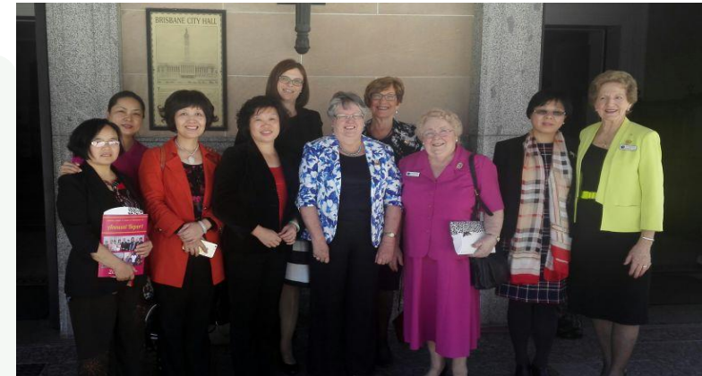
Above: NCWQ members with Women's Federation of Shenzhen, China.

The meeting was an opportunity to discuss how Australia and China address domestic and family violence. The representatives gave us a greater understanding of the Federation's policies established about reporting violence, the support provided to women and families and the involvement of the police.